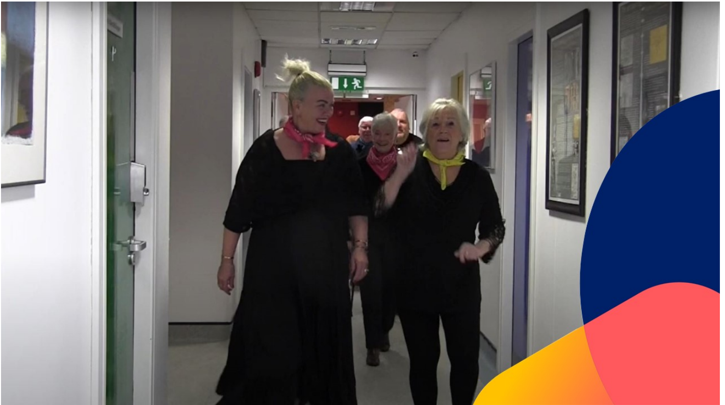
Purple House Cancer Support Choir