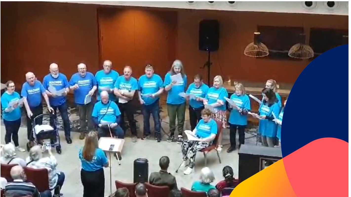
Forget Me Nots Choir