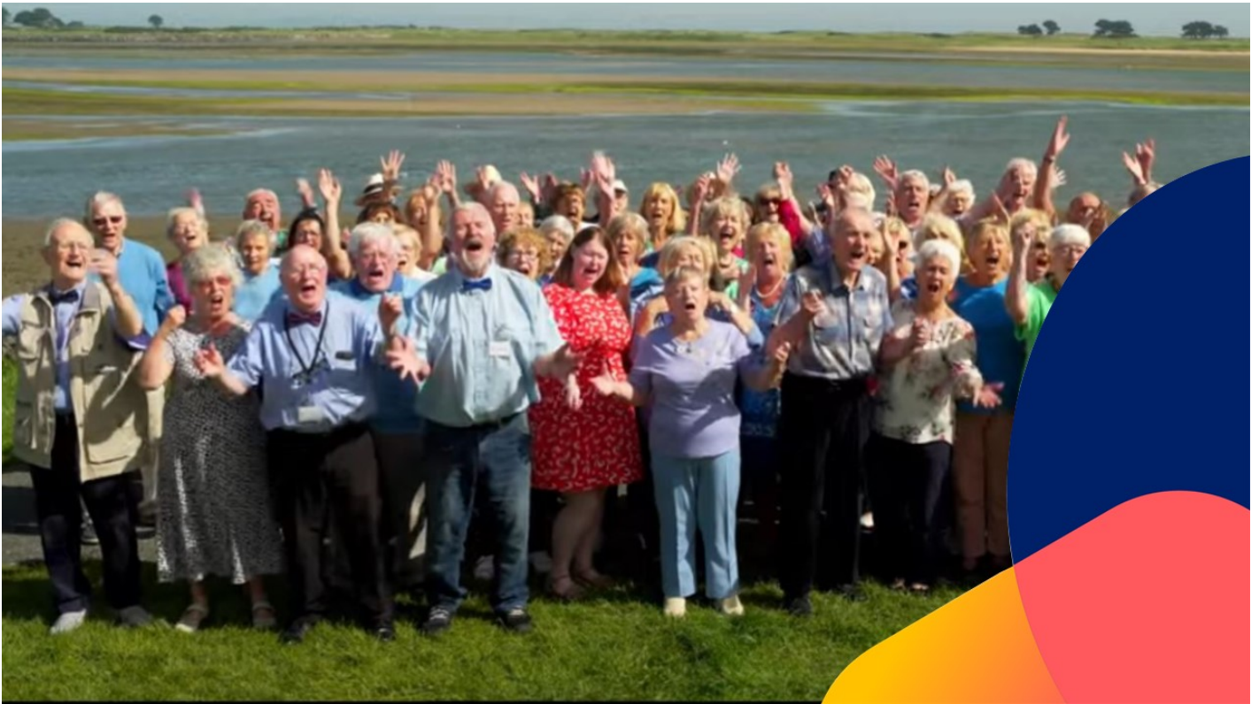
Mercer's Melodies Choir