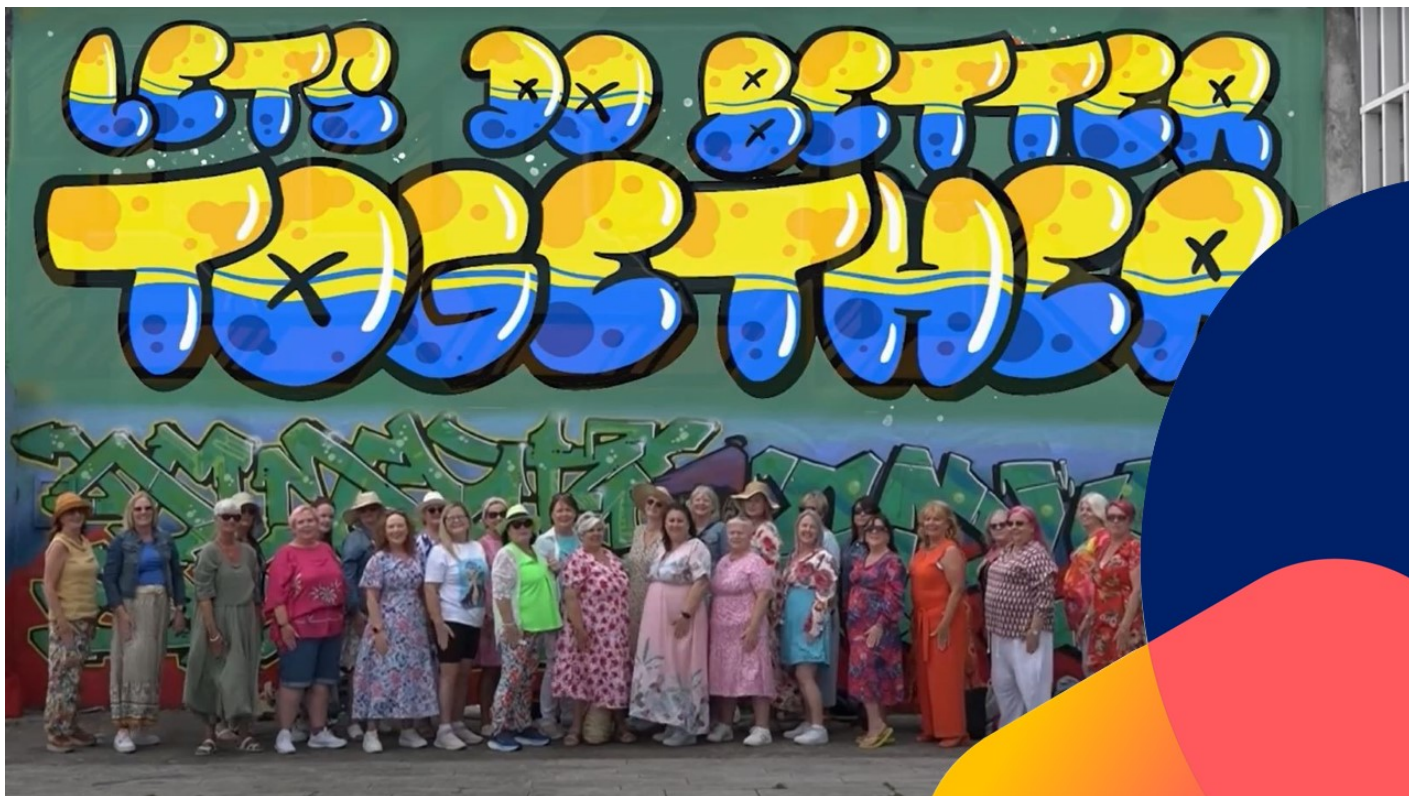
Sing for Life Choir