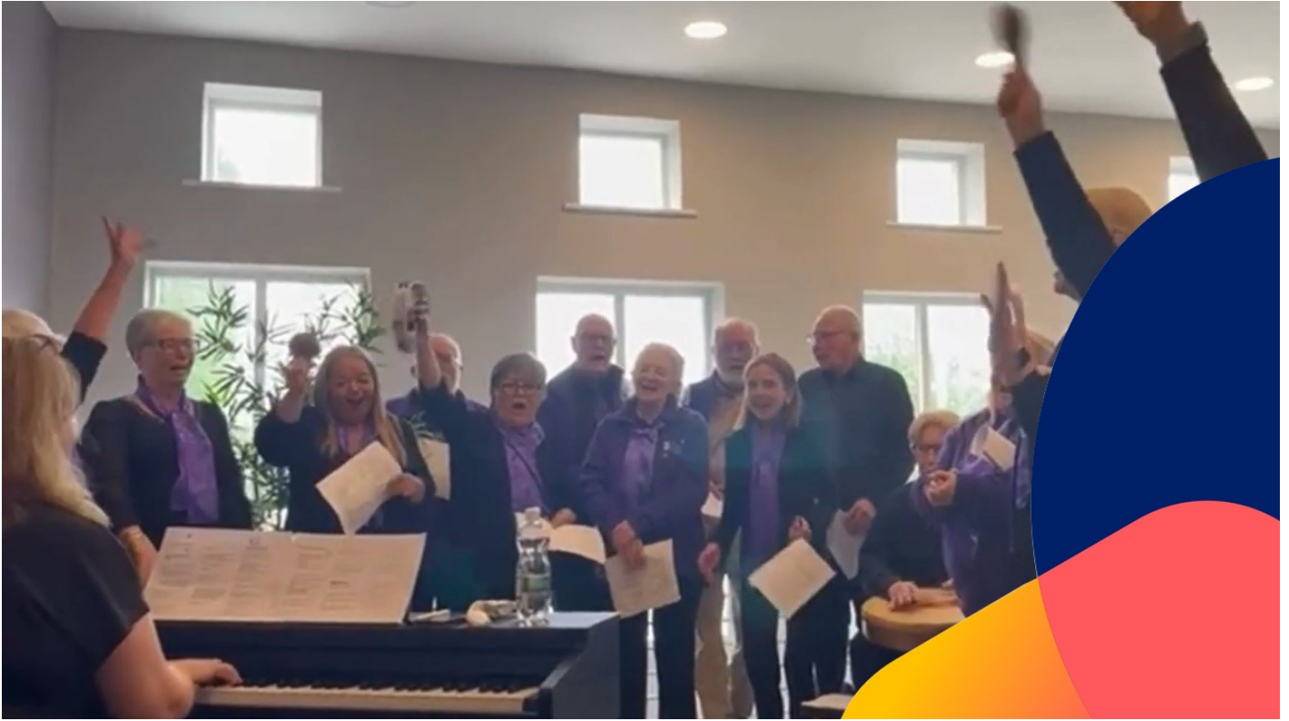
Relay for Life Donegal Survivors Choir