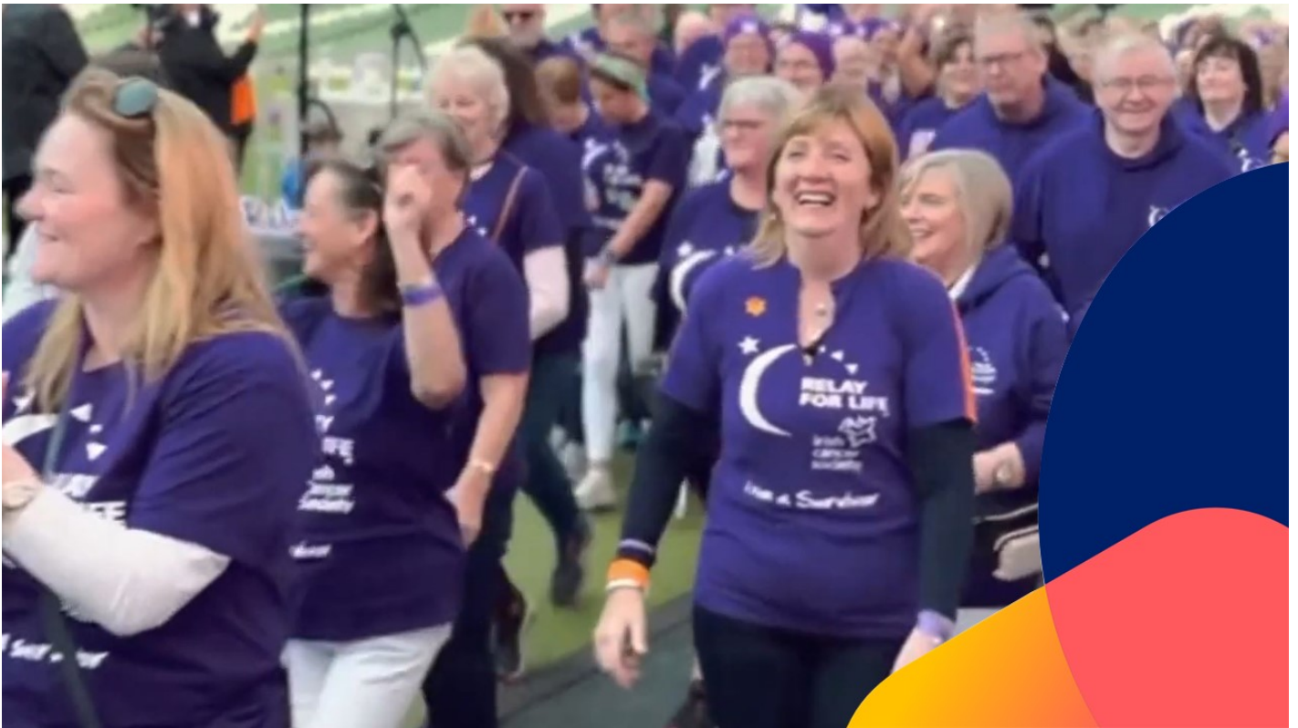
Rhythm of Recovery Choir