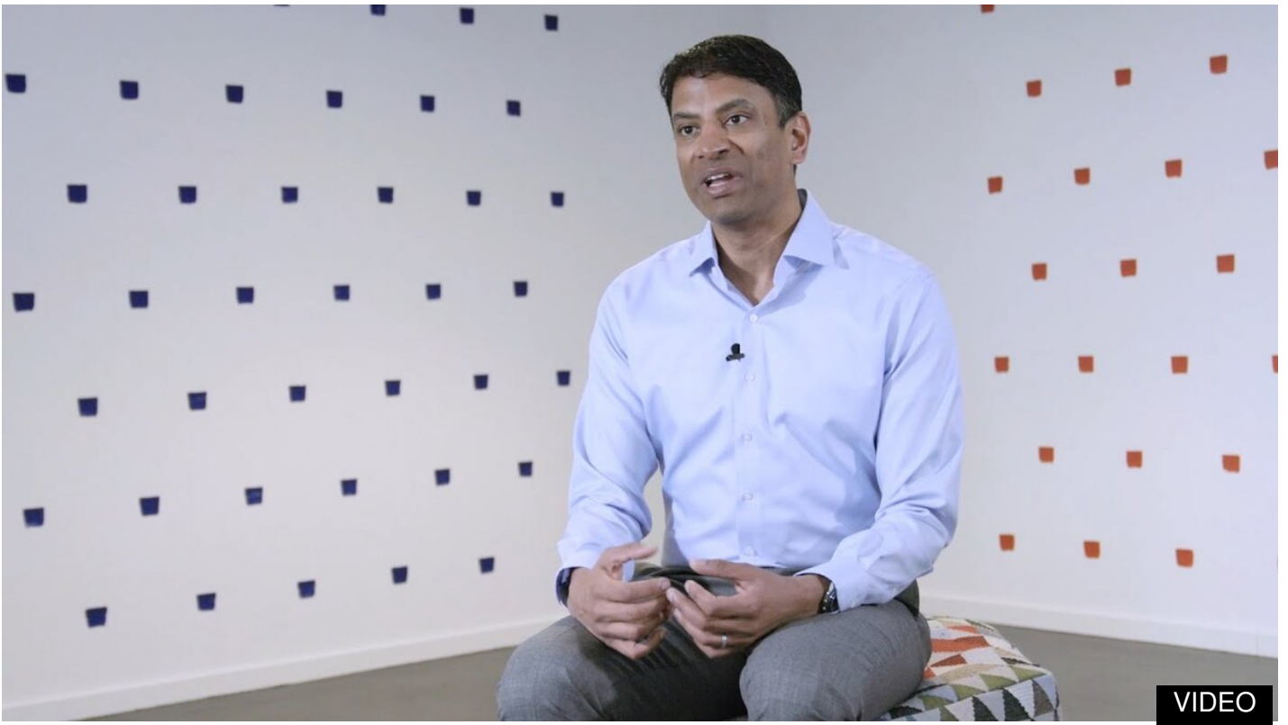
Vas on Instagram