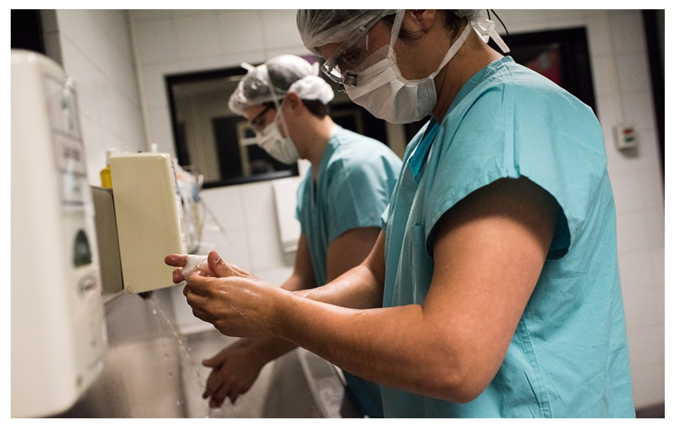
Here he prepares to operate on a liver donor in Santa Fe, a city in northeastern Argentina.