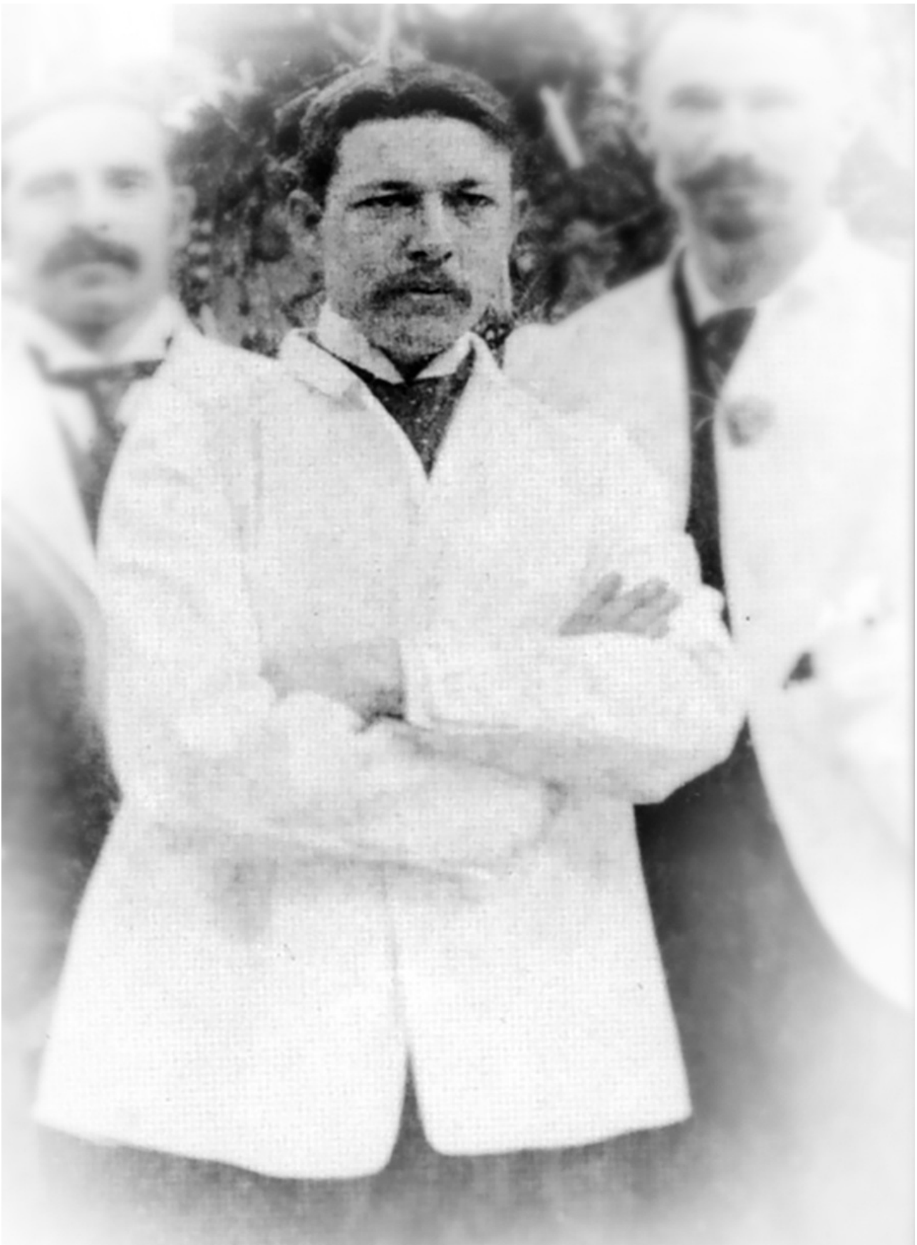
William Coley in 1892. Coley is today considered the “father of immunotherapy.”

More than a century later, Coley is recognized as the first to systematically test the idea of treating cancer by harnessing a patient’s own immune system, an approach known as immuno-oncology, or cancer immunotherapy. This concept is among the most promising in medicine, with the potential to give long-lasting control over once-intractable tumors.