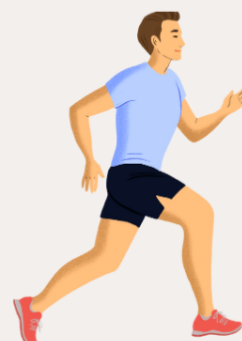
Relief with exercise