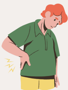
Back pain & stiffness