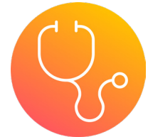
First-In-Human & Clinical Pharmacology