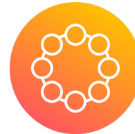
Clinical Trial Management