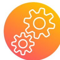
Clinical Strategy & Systems